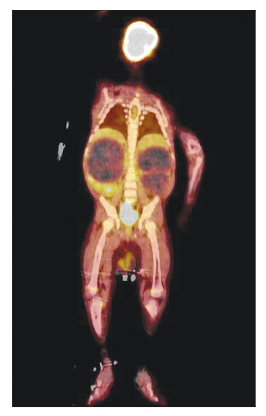
FIGURE 2: F-18 positron emission tomography.

fine septations and macrolobule contours in the left kidney (Figure 1). No solid component was found in the mass. CN and cystic nephroblastoma were considered in differential diagnosis. The F-18 positron emission tomography showed the kidney tissue in the small area in the lower pole of the right kidney, and no significant activity uptake was observed in the